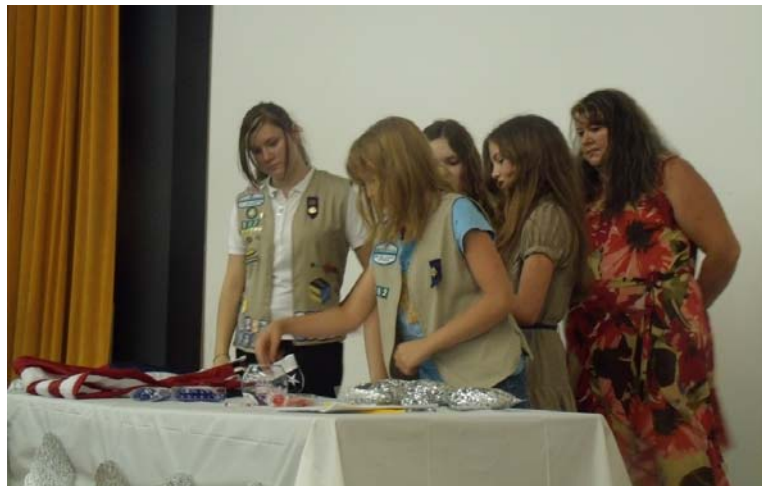
Courtney Girl Scouts opening ceremony for the last Girl-a-palooza May 1, 2012

We are coming to the end of another great Girl Scouting Year!!