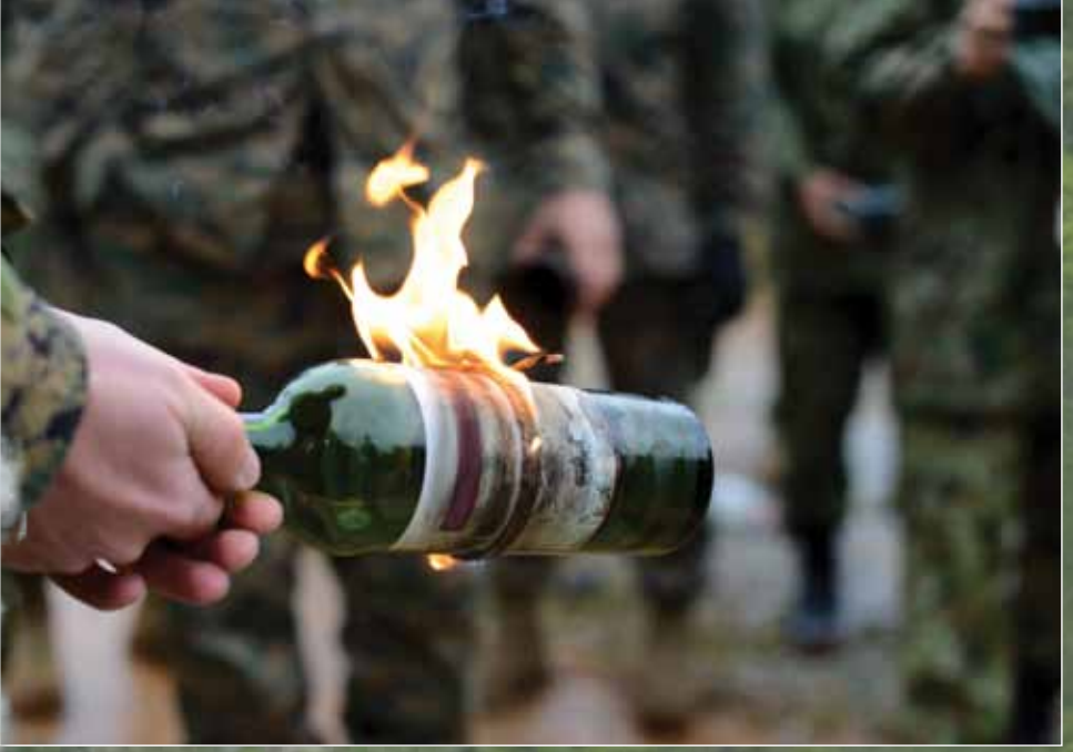
An explosive ordnance disposal specialist with 9th ESB demonstrates how to prepare a wine bottle for use as an improvised shaped charge Feb. 8 at Camp Schwab during basic demolition training. The middle of the bottle was heated along a single line using burning twine before rapid cooling in a bucket of water. The difference in temperature between the heated area and the surrounding glass split the bottle in a controlled manner. The bottom half of the bottle was then used as a shaped charge during the training.

ng basic demolition During the training, types of explosives th Engineer Support nary Force.