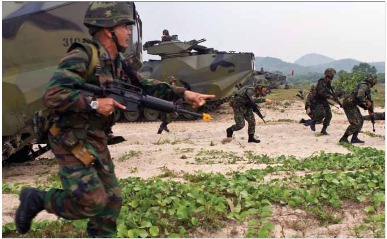
Royal Thai Marines move up the beach during an amphibious assault rehearsal Feb. 13 at Hat Yao, Kingdom of Thailand, as part of Exercise Cobra Gold 2013. The amphibious assault combined the capabilities of Company A, Battalion Landing Team 1st Battalion, 5th Marine Regiment, 31st Marine Expeditionary Unit, and elements of the Royal Thai Marine Corps. The purpose of CG 13 is to improve the capability to plan and conduct combined-joint operations and provide an opportunity for participating nations to build relationships and improve interoperability across the range of military operations.