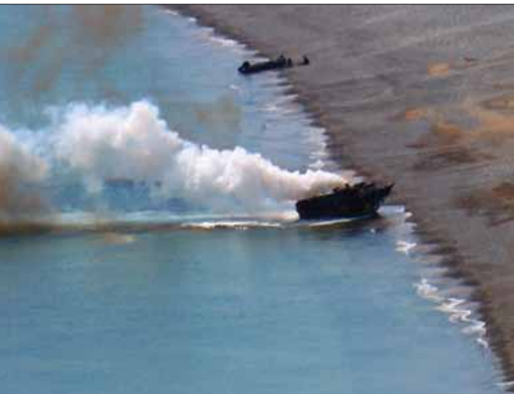
U.S. Marine Corps assault amphibious vehicles come ashore during an amphibious landing on Doksuk-ri Beach April 26 during Exercise Ssang Yong 13. The AAVs and their crews are assigned to Combat Assault Battalion, 3rd Marine Division, III Marine Expeditionary Force.