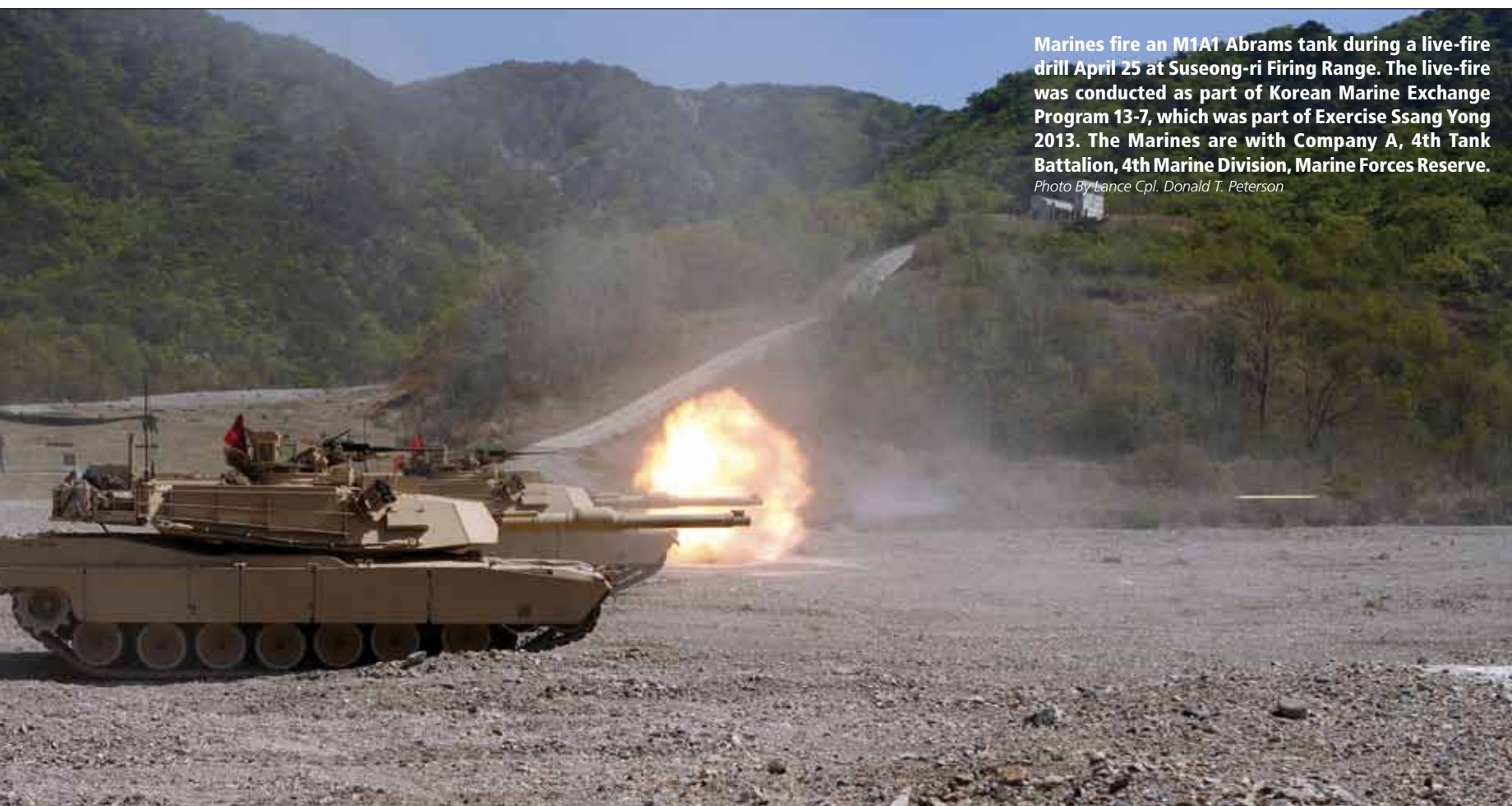
Marines fire an M1A1 Abrams tank during a live-fire drill April 25 at Suseong-ri Firing Range. The live-fire was conducted as part of Korean Marine Exchange Program 13-7, which was part of Exercise Ssang Yong 2013. The Marines are with Company A, 4th Tank Battalion, 4th Marine Division, Marine Forces Reserve.