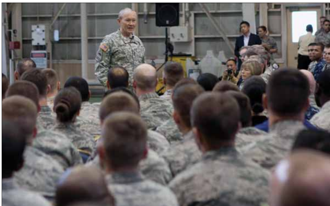
U.S. Army Gen. Martin E. Dempsey addresses Marines and other service members during a town hall meeting April 25 at Yokota Air Base, Japan. Dempsey toured the Asia-Pacific region speaking with key leaders, service members and civilians about the Department of Defense budget, importance of building and maintaining good international relationships, and expressed his gratitude to service members. Dempsey is the 18th chairman of the Joint Chiefs of Staff.